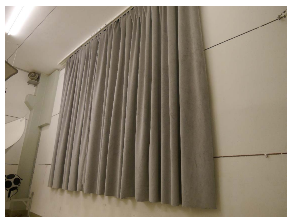
Figure B.2. Test object mounted in the reverberation room, diagonal view.